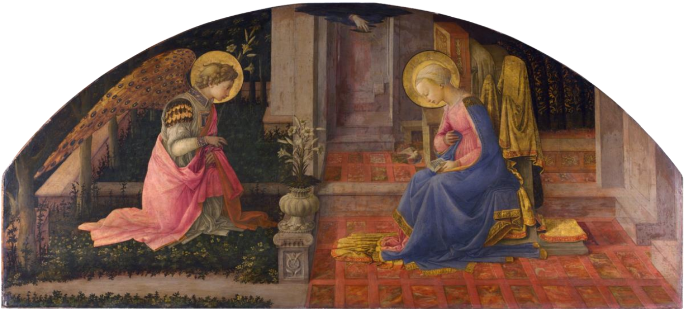
“The Annunciation” by Filippo Lippi, 15 th century