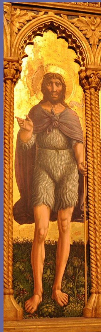
Detail, St. John the Baptist from Altarpiece of the Coronation of the Virgin , Niccolo di Liberatore (15 th century)

John was clothed in camel’s hair, with a leather belt around his waist. He fed on locusts and wild honey. And this is what he proclaimed: “One mightier than I is coming after me. I am not worthy to stoop and loosen the thongs of his sandals. I have baptized you with water; he will baptize you with the Holy Spirit.” –Mark 1:1-8